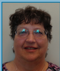
Dea Estes Letter