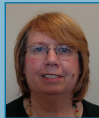
Amber Beall Letter

By Baptism: 13 By Letter: 30 By Statement: 7 = Total: 50