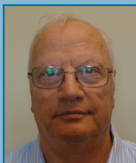
Jack Beall Letter