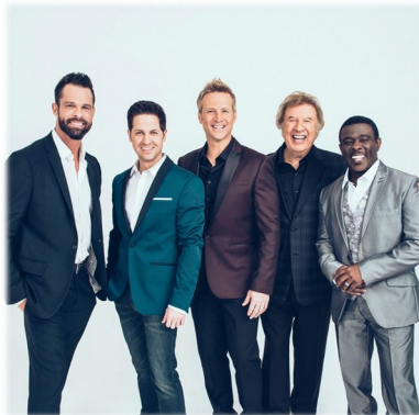
Gaither Vocal Band